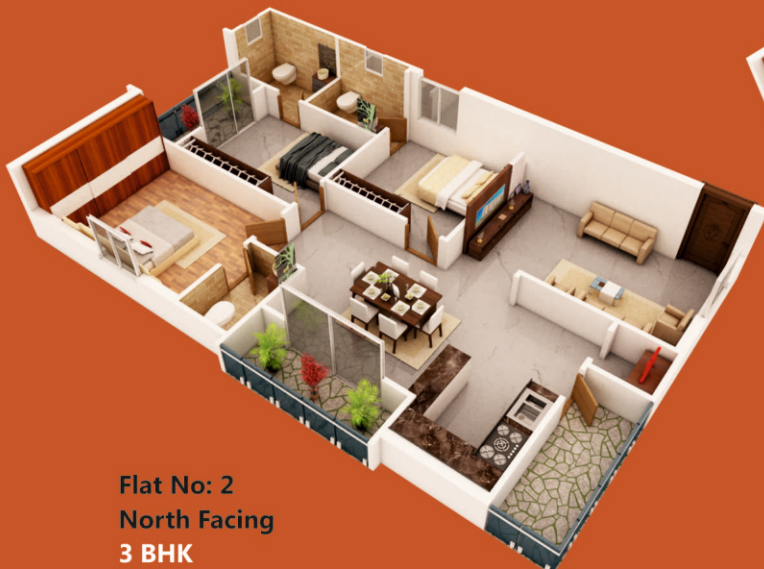
Flat No: 2 North Facing 3 BHK