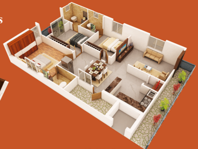
Flat No: 1 East Facing 3 BHK